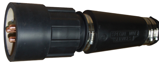
Male Cable Attachable