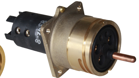
Female Panel Mount