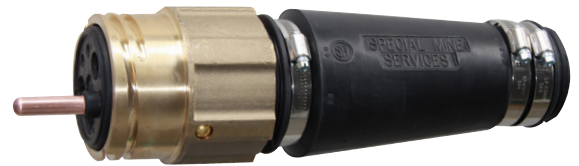
Female Cable Attachable