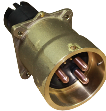
Male Panel Mount